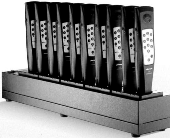
10-slot charger & uploader